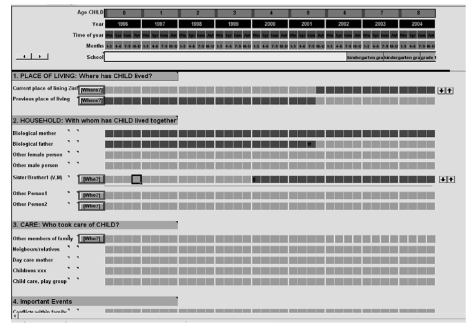
Figure 1 Example of an EHC

Interviewers received detailed instruction about how to use the EHC. Together with the interviewee they go through a worksheet that allows them to code periods and to enter additional codes within the periods in order to capture more detailed information.